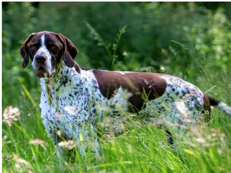
"Jasper" – Droveborough the Twitcher. (show line)