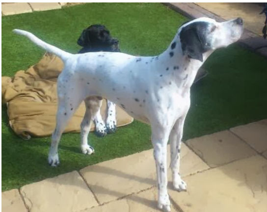
“Nubi” – Bestina Anubis (show line)

Although not an overly common breed in the UK nowadays like a Labrador or Staffie, there are many Pointers in the UK, but in some areas you will be lucky to see another whilst out. Be prepared for passers-by to ask “is that a puppy Great Dane?” Be prepared too for other Pointer owners making a beeline to you and your dog wanting to say hello!