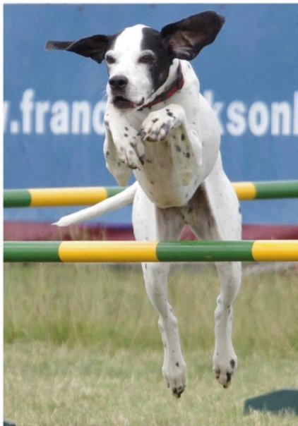
“Murphy” – Gamedawn Tullibardine

Pointers are loving, loyal, gentle, sweet and affectionate, and love to be around you.