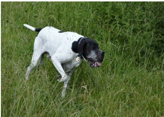
"Bob" (Rescue working line)